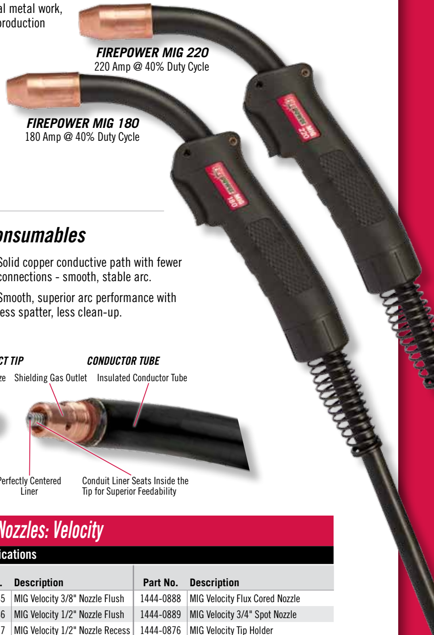
FIREPOWER MIG 220 220 Amp @ 40% Duty Cycle