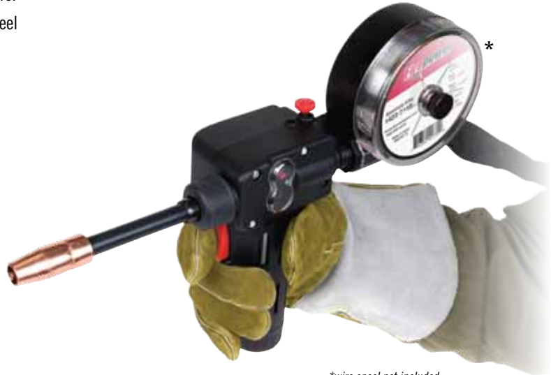
*wire spool not included